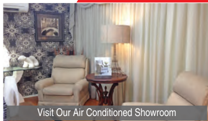
Visit Our Air Conditioned Showroom